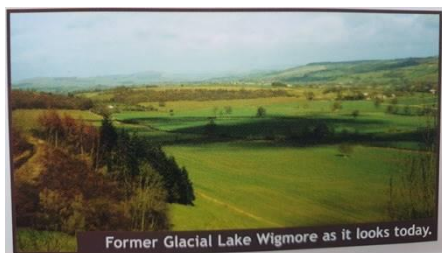
Former Glacial Lake Wigmore as it looks today.

Note: Both Wigmore Castle and Downton Gorge are at present not open to the public