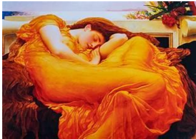
Flaming June by Sir Frederic Leighton painted in 1895.

June brings the summer solstice when the northern hemisphere is tilted towards the sun at its maximum tilt. This year the solstice will take place at 0924hrs (BST), 21 st June. Midsummer's day is on the 24 th June and is a quarter day in the UK Legal Calendar.